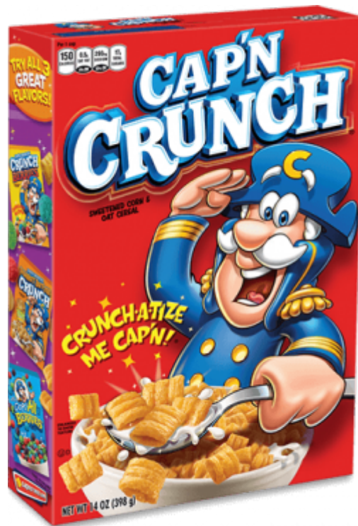
Cap'n Crunch® Original