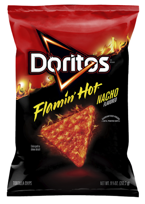
DORITOS® FLAMIN' HOT® Nacho Flavored Tortilla Chips