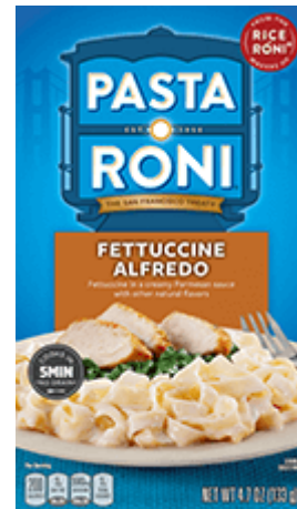
PASTA RONI® Fettuccine Alfredo