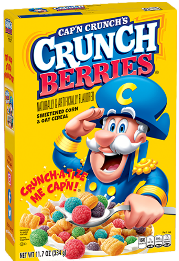
Cap'n Crunch's Crunch Berries®